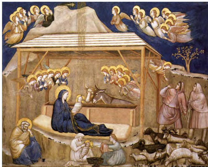
Giotto "The Nativity"

2649 N. Francisco Ave. • Chicago, IL 60647